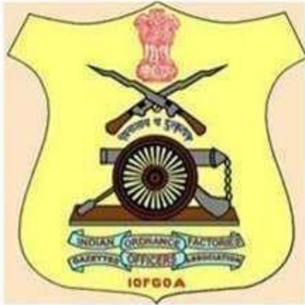
Gun Carriage Factory Jabalpur Recruitment